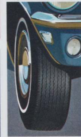
Wide-ovals come with either Radial or Bias Ply