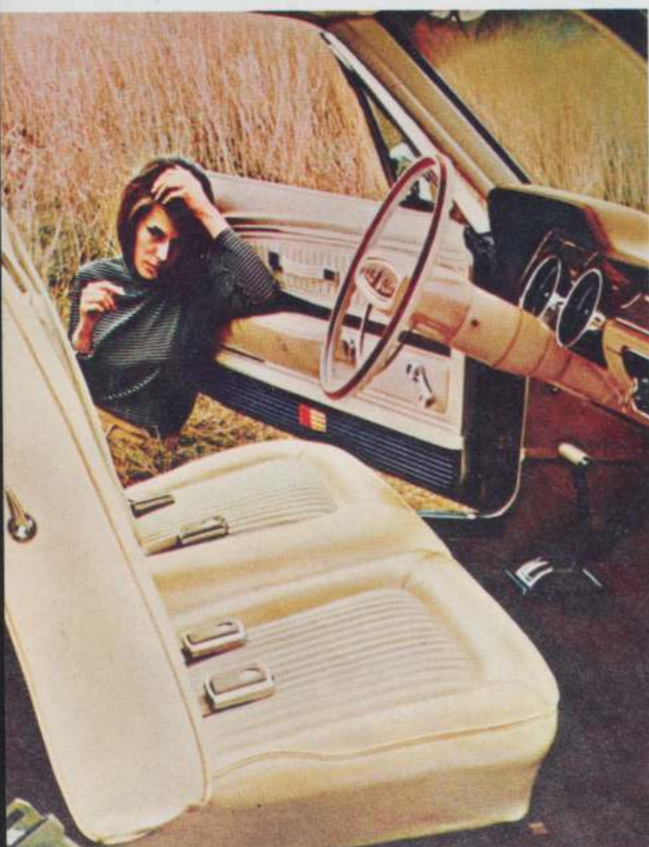
For openers, Full-Width Seat and Decor Group

DESIGNED TO BE DESIGNED INTO YOUR PERSONAL GT/CS