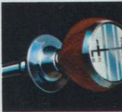
4-Speed Stick Shift