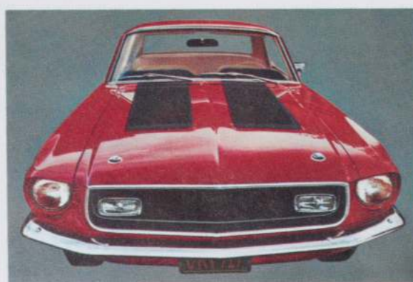
Two-Tone Hood goes with any Mustang color