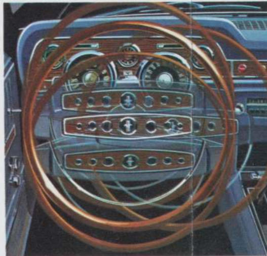
9-position Tilt-Away Wheel adjusts to you