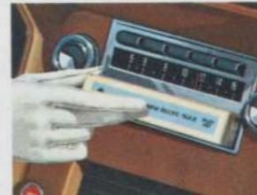
Stereo Tape System