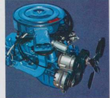
Four V-8's—up to 390 cubes!