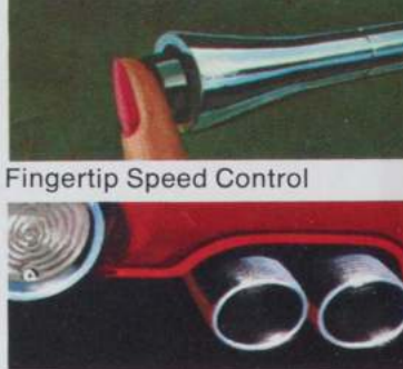
Quad Exhausts (GT Group)