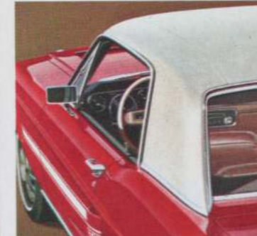
Vinyl Roof Covering