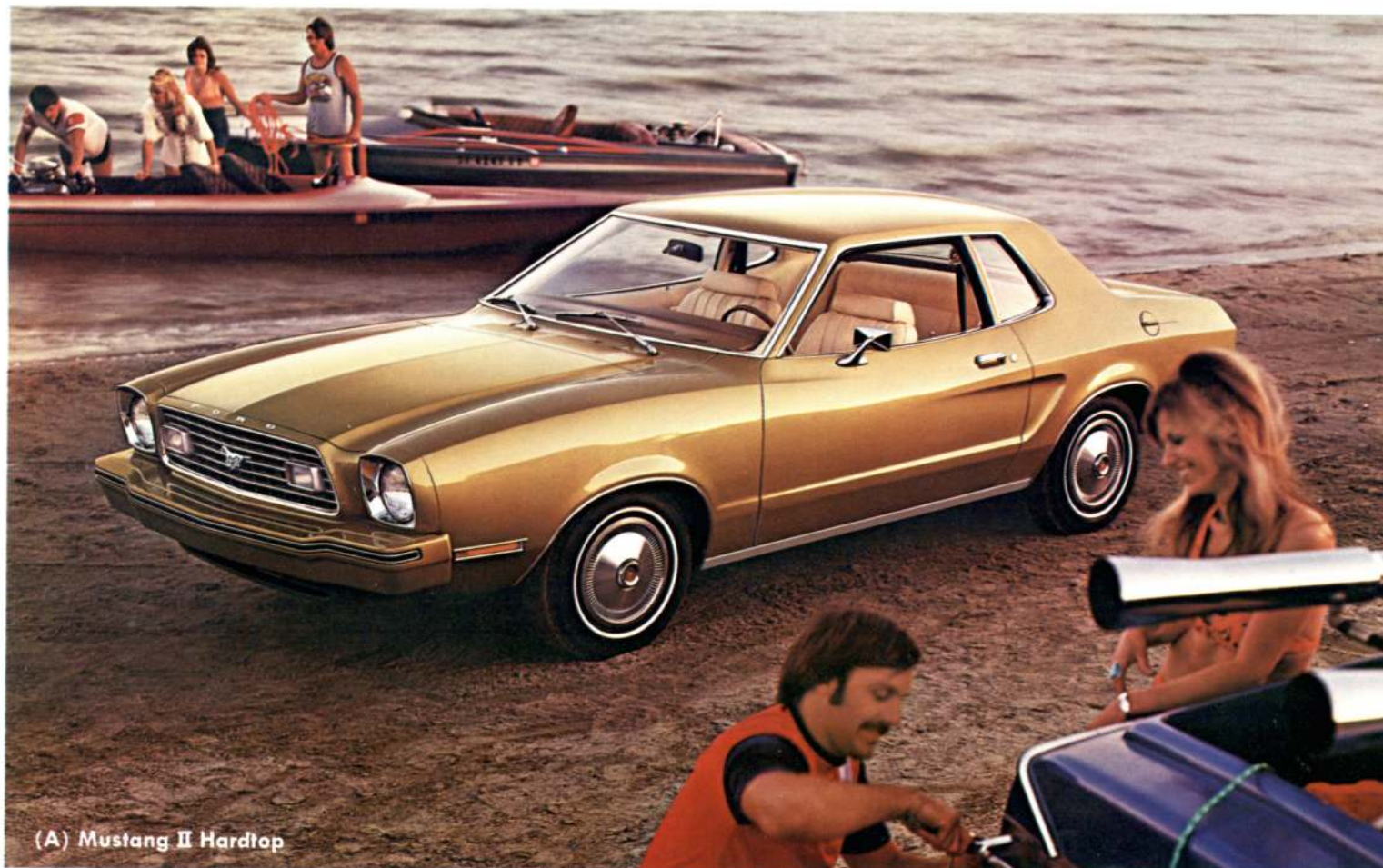
(A) Mustang II Hardtop

Note: See Notable Standard Features, measurements and color code reference on back cover. Some items shown are optional, such as 302 V-8, dual sport mirrors, White painted lacy spoke aluminum wheels, wide-band WSW tires, rocker panel moldings, full wheel covers and WSW radial tires.