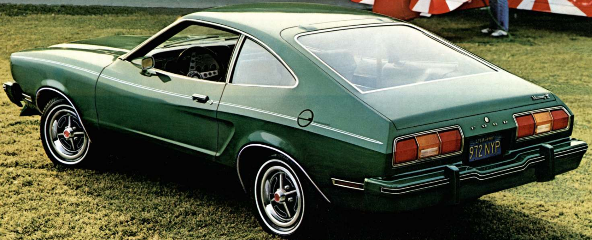
(D) Mustang II 3-Door 2+2