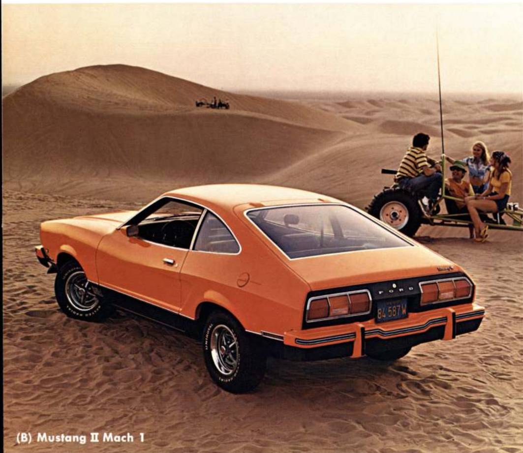
(B) Mustang II Mach 1