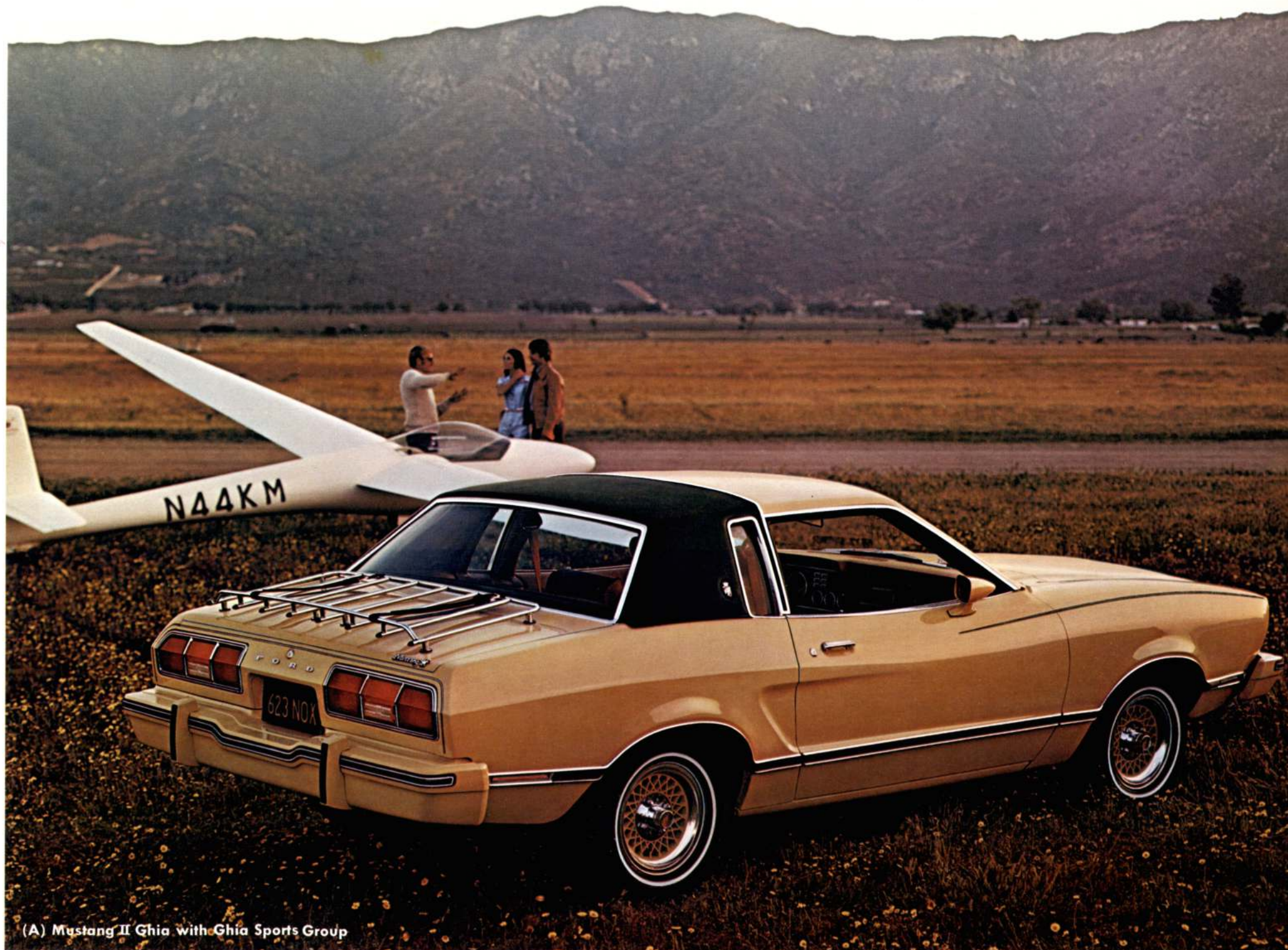
(A) Mustang II Ghia with Ghia Sports Group