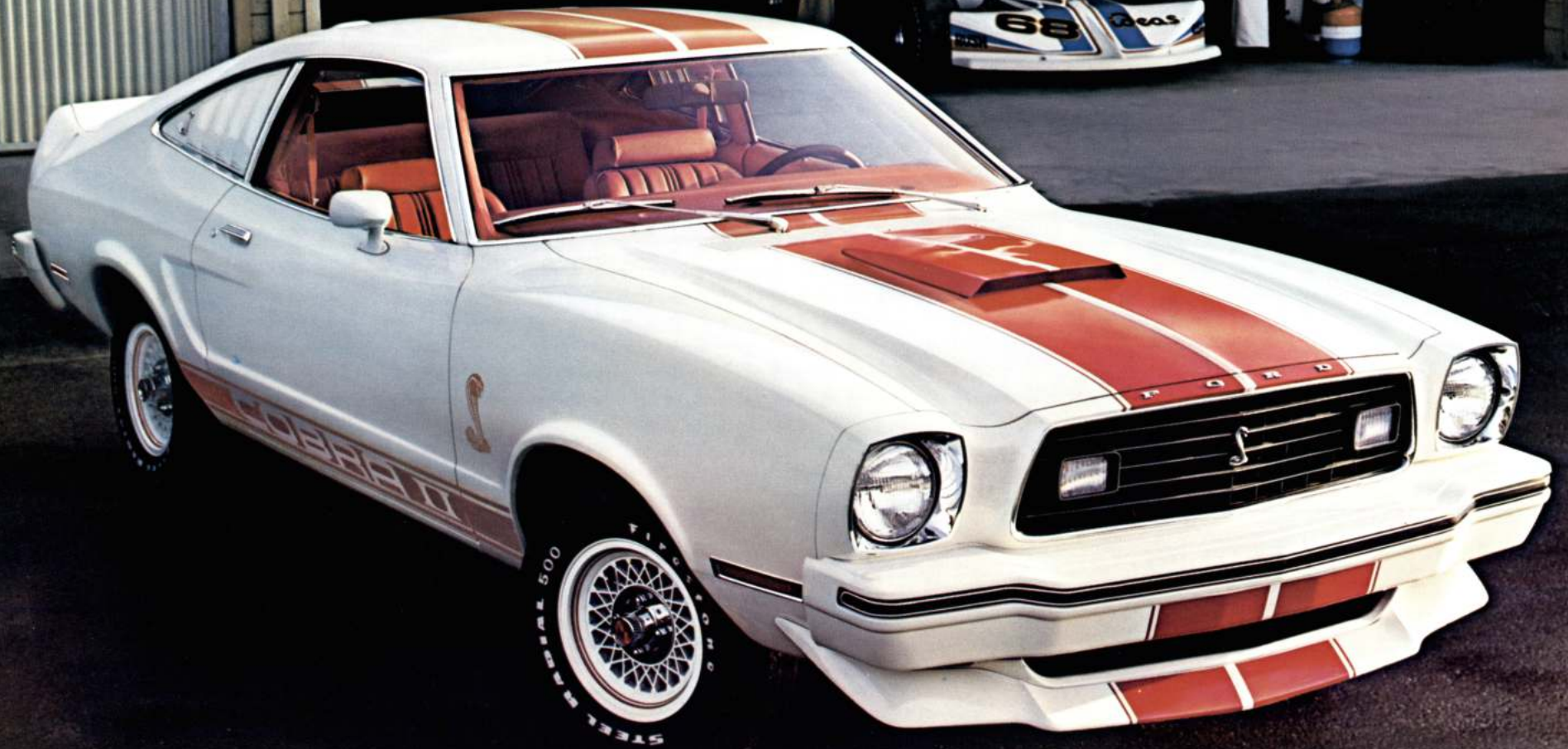
(A) Mustang II Cobra II