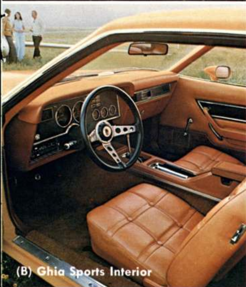
(B) Ghia Sports Interior