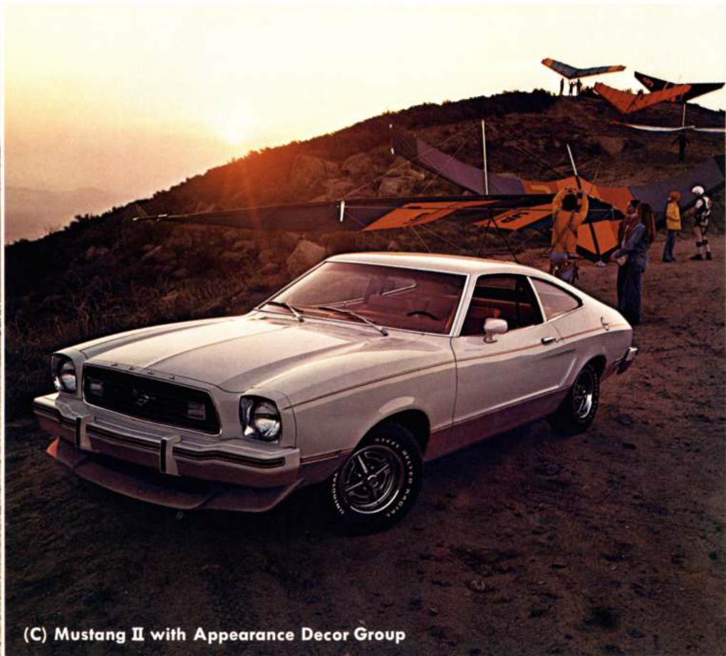
(C) Mustang II with Appearance Decor Group

(A) Cobra II. Mustang II's runaway sales success. (left) Combine extra flair with your driving fun by choosing the new Cobra II Package option, shown at left, in four exciting color versions.