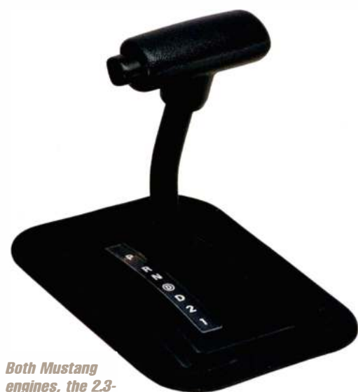
Both Mustang engines, the 2.3- and 5.0-liter, can be teamed with the convenience of an optional floor-mounted automatic overdrive transmission.