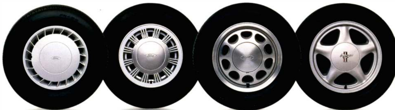
Left to right: finned wheel cover (standard on LX); styled road wheel (included in LX Preferred Equipment Package); cast aluminum wheel (optional on LX); and 5-spoke cast aluminum wheel (standard on GT and LX 5.0L).