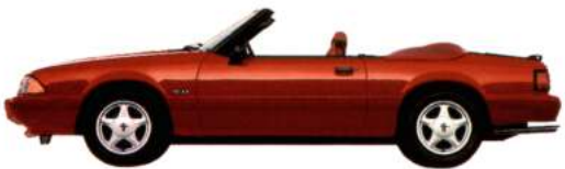
Mustang LX 5.0L Convertible