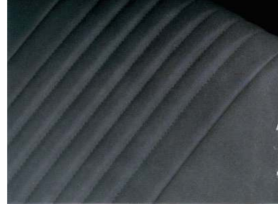
Above: Articulated sport bucket seats, standard in GT and LX 5.0L, shown with available leather trim in Opal Grey.