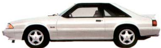
Mustang LX 5.0L Hatchback