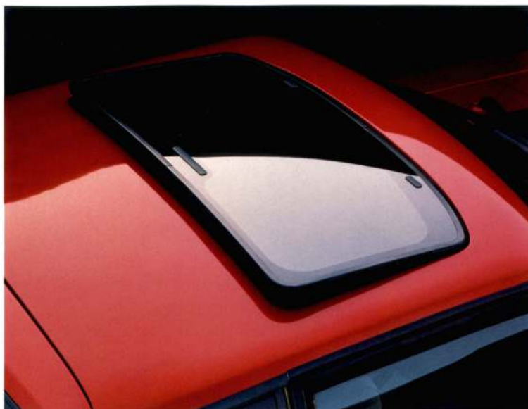
Left: The flip-up open-air roof option, for the hatchback model, lets in extra fresh air (when opened) and more sunshine.

To further personalize your Mustang, choose from the selection of options available separately, some of which are shown here.