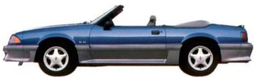
Mustang GT Convertible