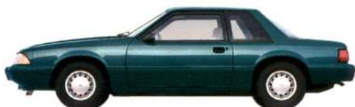
Mustang LX 2-Door Sedan

Also in Mustang LX's list of standard features are power steering, power front disc/rear drum brakes, and nitrogen gas-pressurized hydraulic front struts and rear shocks. Plus many features for your comfort and safety, including a driver-side air bag Supplemental Restraint System (SRS) designed for use with your safety belts.