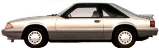
Mustang LX 2-Door Hatchback