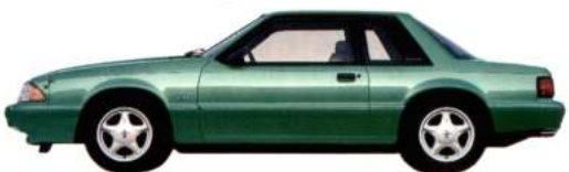
Mustang LX 5.0L 2-Door Sedan