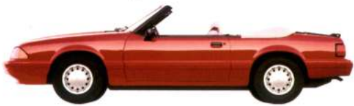
Mustang LX Convertible