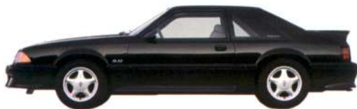
Mustang GT 2-Door Hatchback

The Mustang LX combines sporty styling with the spirited yet economical performance of a 2.3-liter I-4 engine, equipped with two spark plugs per cylinder and the precise fuel delivery of a multi-port electronic fuel injection system (EPA estimates unavailable at press time).