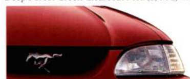
Rio Red Tinted Clearcoat (S, MG, B, W)