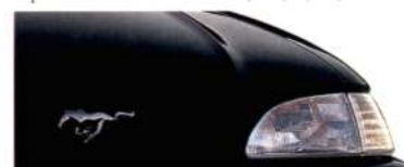
Black Clearcoat (S, MG, B, W)