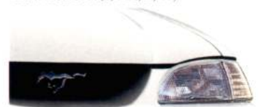
Crystal White Clearcoat (S, MG, B)

Interior Colors: Saddle (S); Medium Graphite (MG); Black (B); White (W)—convertible only