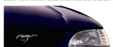
Deep Violet Clearcoat Met. (MG, B, W)