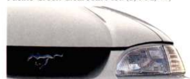
Opal Frost Clearcoat Met. (MG, B, W)