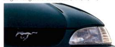
Deep Forest Green Clearcoat Met. (S, MG, W)*