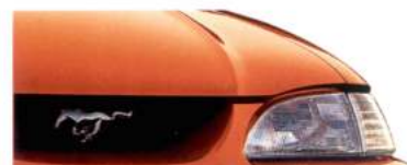
Bright Tangerine Clearcoat (MG, B, W)*

▲ Left to right: 15" wheel covers (standard on Mustang); 15" cast aluminum wheels (optional on Mustang); 16" cast aluminum wheels (standard on Mustang GT); and 17" cast aluminum wheels (optional on Mustang GT).