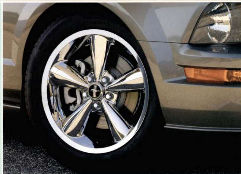
Custom Wheels. These new Mustang 18" wheels rock...and keep you rolling in style. You'll find a great selection of custom-designed wheels on page 6.