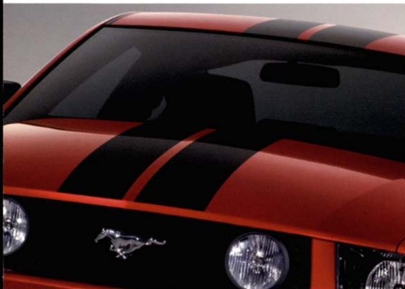
Racing Stripes. Add sporty style by personalizing your 'Stang with this best-selling kit. See page 5 for details.

Turn the page and discover a complete catalog of great choices to help you personalize your new Mustang. Engineered by Ford for a perfect fit and long-wearing durability, Genuine Ford Accessories click with the image of your American dream car: they're sportive, spirited and ultimately stylish. What's more, you can rely on precise professional installation at your Ford dealer and the backing of one of the industry's strongest limited warranties.