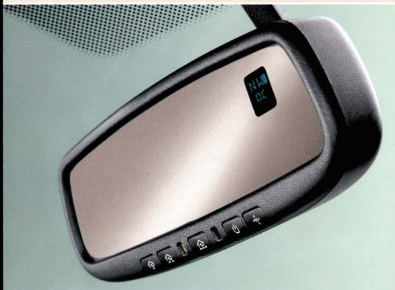
Electrochromic Mirrors and Electrochromic HomeLink® Mirrors. These top-selling mirrors eliminate headlight glare, plus much more! See page 6 for more details on their state-of-the-art features.