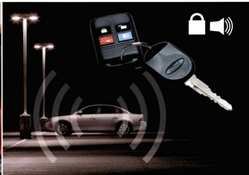
Vehicle Security System. On page 7, we offer products that are designed for your convenience and protection. This popular, state-of-the-art system protects your vehicle and its contents.